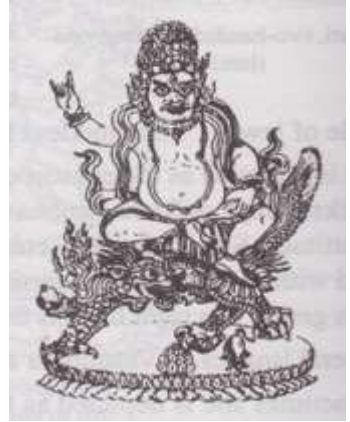
Figure 13: Jambhala or Buddhist Kubera

Tibetan deities. The figure of Jambhala or the Buddhist Kubera is usually illustrated with 'pot-bellied' and notable for wearing rich ornament. Moreover, he holds a lemon (Jambhara) in the right hand and a "mongoose (nakula) vomiting jewels" in his right hand (Fig-13)<sup>25</sup>. The image of Kubera (Fig-14) in the Curzon Museum of Archaeology at Mathura in India (it is now called the Government Museum) is typically represented with protruding abdomen, which is fasten with a scarf, and he is in Rajalila Asana, left knee raised and right leg in meditative position<sup>26</sup>. Although both hands are missing, it is supposed that the left hand hanging loosely over the left knee, and the right hand probably leaning on the ground are the usual position of Hindu deities. He wears big earrings and a heavy garland hooping his neck. The hair on his head looks like a snail curl, and small knot supposed to be the end of long hair is above the large abdomen. His torso is completely bare, but he wears a short garment in his lower part.