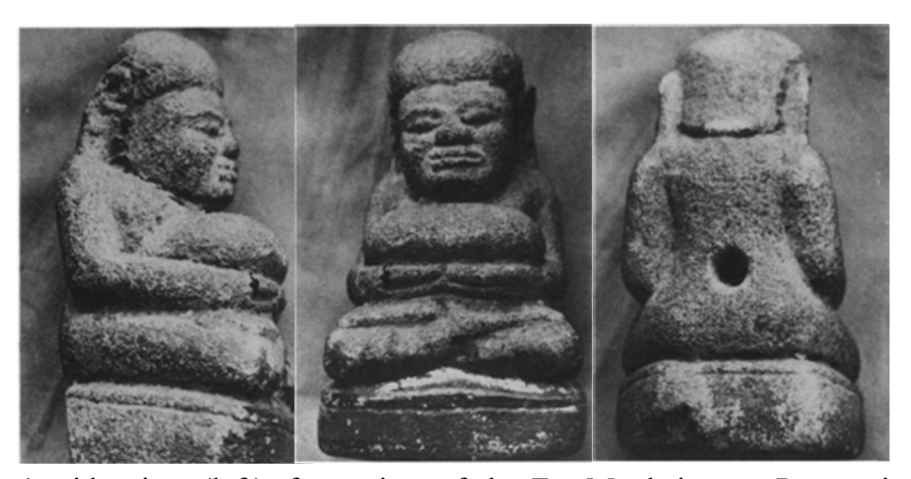
Figure 1: side view (left), front view of the Fat Monk image, Pyu period (middle), back view (right) photo – Luce, 1970, Plate 90 a, b& c.

A number of fat monk images have been found throughout Myanmar from Pyu (c 200 BCE- 900 CE) period through the 9-13CE Bagan and onto the post Bagan period, 17<sup>th</sup> century. They stylistically not similar, except the protuberant belly. The iconographic variation of the image presumably shows the differences between one period and another. Generally, the fat monk images can be classified according to their styles. They are as follows - the image: without robe and with hair like wearing a thin helmet or shaven head, with a robe and long hair, and then wearing robe and curly clustered hair. These are the most typical types of the images so far discovered in Myanmar.