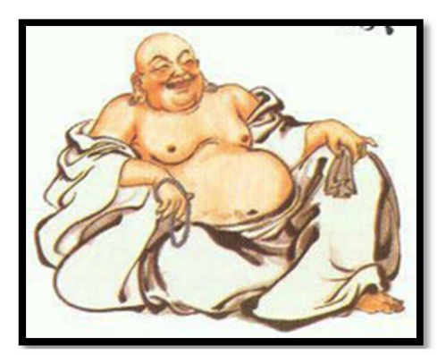
Figure 12: Mi Lo Fo or Maitreya Buddha, China

Nonetheless, the practice of this Chinese god of wealth can still be found at Kentung, which is a town in Shan state, Myanmar and is also a border town near the trade route between China and Thailand. The Shan call him Maha Kachai. Legendarily, he was a follower of the Buddha, and extremely handsome. Because of his beauty, women ignored even Buddha when contributing their offerings. To escape from the attention of women, he turned himself into fat and ugly<sup>23</sup>. The story of Maha Kachai is closely similar to the fat monk called Sangkachai of Thailand. It will be more discussed later.