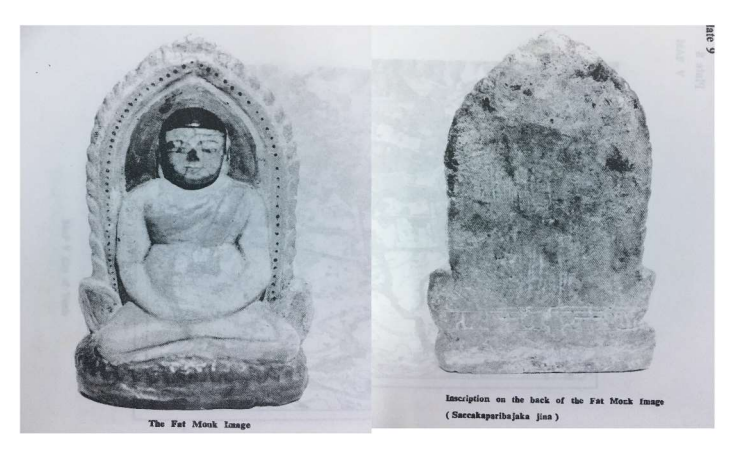
Figure 17: Fat monk image with Arakanese inscription on back

It is a question whether the different stylistic features of the potted belly images represent for different characters or not. There are two possibilities out of many identifications of the Fat monk image. They are the Chinese god of wealth, who can also be regarded as Bodhisattva Maitreya, and the monk Kaccāyana of Thailand. Although the Pyu and Burmese of Bagan period predominantly followed the art, architecture and custom of Indian, the Chinese influence over Myanmar was obvious especially in Pyu and Bagan period. Therefore, the cult of fat monk image probably derived from China along with trade, the option noted above that the similarity of the Mon-Burmese fat monk and various images from Thailand. It could be accounted for through copying of foreign images. Another assumption for the origin of the fat monk image was local innovation. This links to the copying from external models resulting in a variety of local innovations.