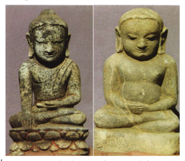
Figure 8 & 9: 13<sup>th</sup> century Buddha image of Bagan (left) and naked Fat Monk image, probably 13<sup>th</sup> century, Bagan