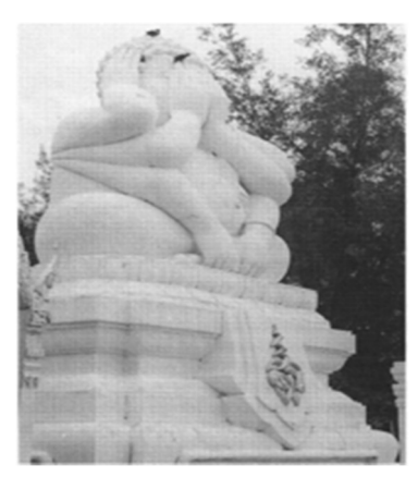
Figure 7: Phra Gawam closing his six roots of sensations, Entrance of Wat Nerancharama in Cha-am

Chinese laughing monk Qici or Budai (Maitreya)<sup>14</sup> although they both have been occasionally installed in Buddhist monastery<sup>15</sup>.