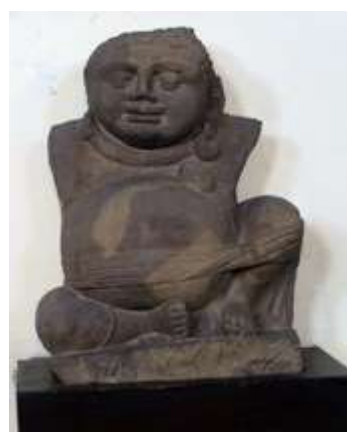
Figure14: Kubera, Lord of the Yakshas, Mathura<sup>27</sup>