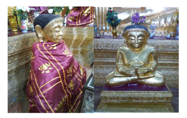
Figure 10 : Fat monk image worshipped as the Buddha

With regard to the role of fat monk, a sandstone image (Fig-9) was discovered amongst the ruins of the Sutaung Pyi (wish fulfilling stūpa) pagoda in Bagan. It is found together with two Buddha images of different period, a small miniature bronze stūpa and two reliquaries containing relics<sup>16</sup>. These all are supposed to be objects of the former relic chamber of the ruined pagoda. In comparison with the early 13<sup>th</sup> century Buddha image (Fig-8) found in this ruin, the facial expression and long earlobes of fat monk image are exactly same. These two images were no doubt created in the same period. Stūpas usually enshrine with relics, Buddha image, plates or books inscribed canonical texts, and objects related to Three Jewels (Buddha, Dhamma and Sangha). In this case of the discovery of potted belly image together with the enshrinement objects, he could be regarded as the Buddha or the monk representing for the whole Sangha community. The status of fat monk image later changed into or regarded as the Buddha (Fig-10) can be seen at Myeik in the Lower Myanmar. It has been renovated and turned into Buddha holding a begging bowl. It is noted that sometimes changing the role of status by renovating the image can be seen.