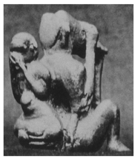
Figure 6: Potted belly image back to back with Ganesha image

Photo: Courtesy of Win Naingphoto: Luce, 1970, Plate 89 g.