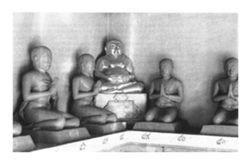
Figure 15: Kaccāyana or Sangkachai Figure 16: Fat monk installed above the above other monks who are in veneration posture, Wat Khanikaphon, Bangkok