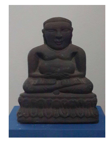
Figure 11: Sand stone statuette of fat monk

Maitreya but no worship of his image, pagoda and vihara sorely dedicated to him in Myanmar, except the Chinese people (Mahayana) cult of Maitreya.