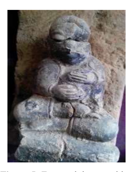
Figure 5: Fat monk image with different hand Posture