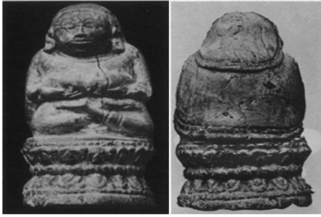
Figure 3: Front view of the long hair fat monk wearing robe (left) and back view (right)

Apart from these four types of images, there is another type of image, which can also be considered as the fat monk. The different style of fat monk image (fig-5) has recently been found near Yangon, the ancient Mon area. The face and left side of the lower part of image was damaged, but it can be clearly seen other part of the body. The image is shown here seated on plain pedestal. He has a smooth round head and probably has a long hair because of the thin helmet, which looks like the image of the Bagan period. The drapery is blanketed his body rather than wearing a monastic robe. The figure is seated in crossed-leg position, one on another. The distinctive feature of this image is the hand position, which is not similar to the other image; the right hand covering his protuberance belly and the left hand touching his chest.