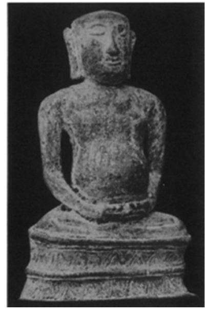
Figure 2: Fat monk with shaven head photo – Luce, 1970, Plate 91 e.

Another type of figure (Fig-2), which was recovered from one of the relic chambers of the ruined pagoda at Bagan<sup>2</sup>, is relatively significant because of his square face and shaven head. Vague outlines on the throne indicated that he is seated on double lotus pedestal. No trace of the robe can be found on his torso.